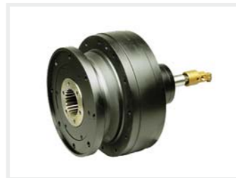
ZS with splined hollow output shaft