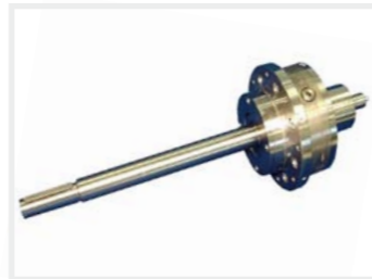
ZS with solid output shaft