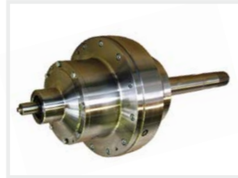
ZSPN, ZSPV, ZSPR